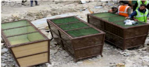
Biobins for collection and treatment of organic wastes