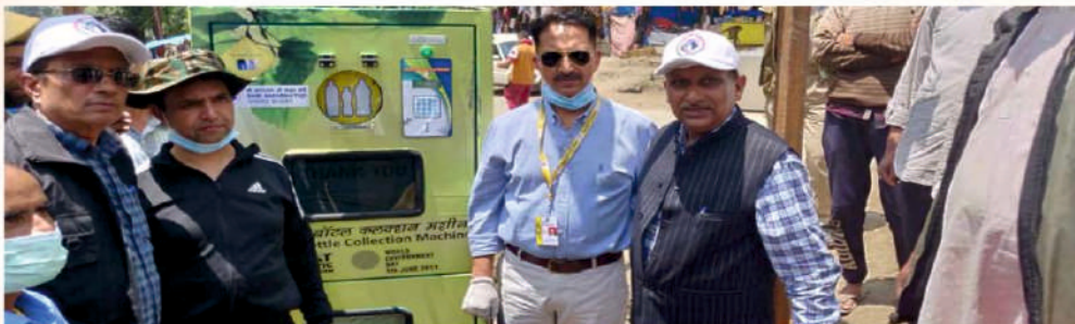
Reverse Vending Machine installed by Shrine Board at Chandanwari for shredding and disposal of waste plastic bottles.