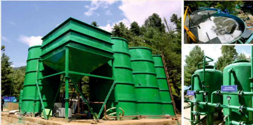
A Sewerage Treatment Plant on MBBR (Moving Bed Bio Reactor) technology installed at Nunwan Base Camp for effective treatment of sewerage generated at Nunwan Camp. Shrine Board accords high level of importance to environment, cleanliness & hygiene.