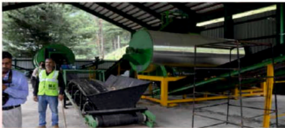
Solid waste management plant at Serbal, Pahalgam.